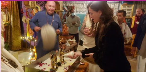
Abhisheka of Gaura Nitai during Gaura Purnima Festival